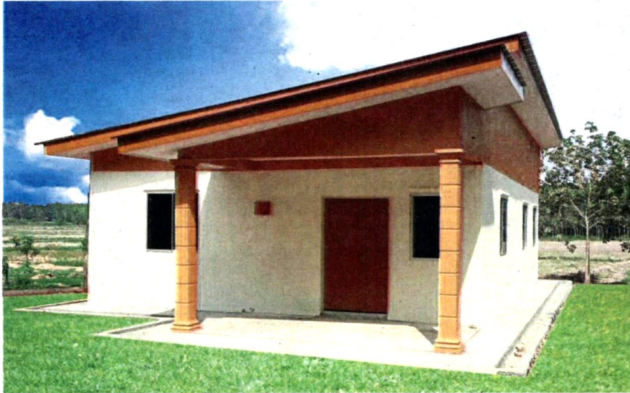
The design of a 1,000sqft Rumah Mesra Rakyat (RMR) unit.

DESPITE the challenges arising from the current Covid-19 pandemic, the Government remains committed to provide comfortable and quality housing for Malaysians through allocations in Budget 2021.