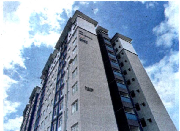
As of June 2020, a total of 546,755 houses are in various stages of implementation under affordable housing programmes including PPR, PPAM, PRIMA and SPNB.