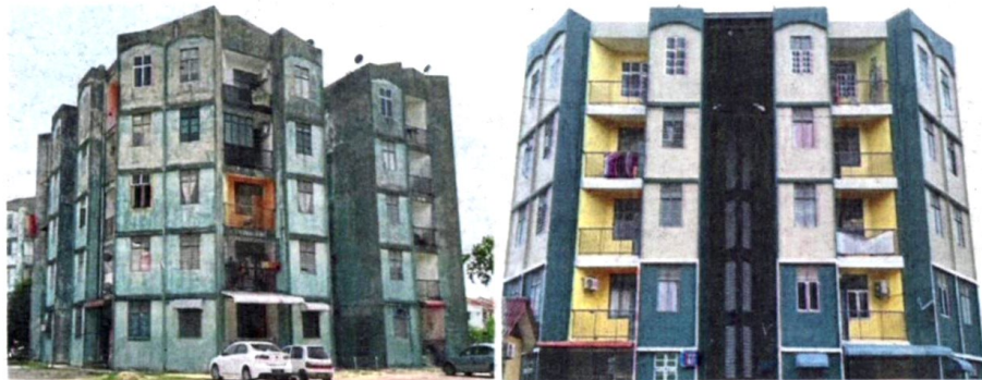
The repainting work of Bandar Baru Kubang Kerian Apartment in Kota Baru is among the many maintenance projects under the TTPM - before (pic left) and after (right).